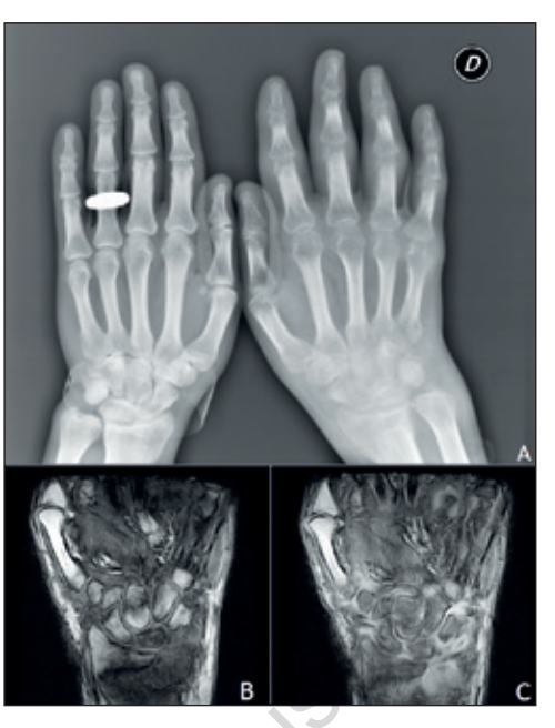
Figure 1 - Anteroposterior radiograph of the hands (A) showing marked soft tissue swelling and iuxta-articular osteoporosis of the right one. Pre- (B) and post-contrast (C) coronal Turbo Spin Echo 3D magnetic resonance imaging sequence of the right wrist: synovial swelling and bone marrow oedema are characterized by contrast enhancement.

Radiographs of hands and wrists showed swelling of the proximal interphalangeal