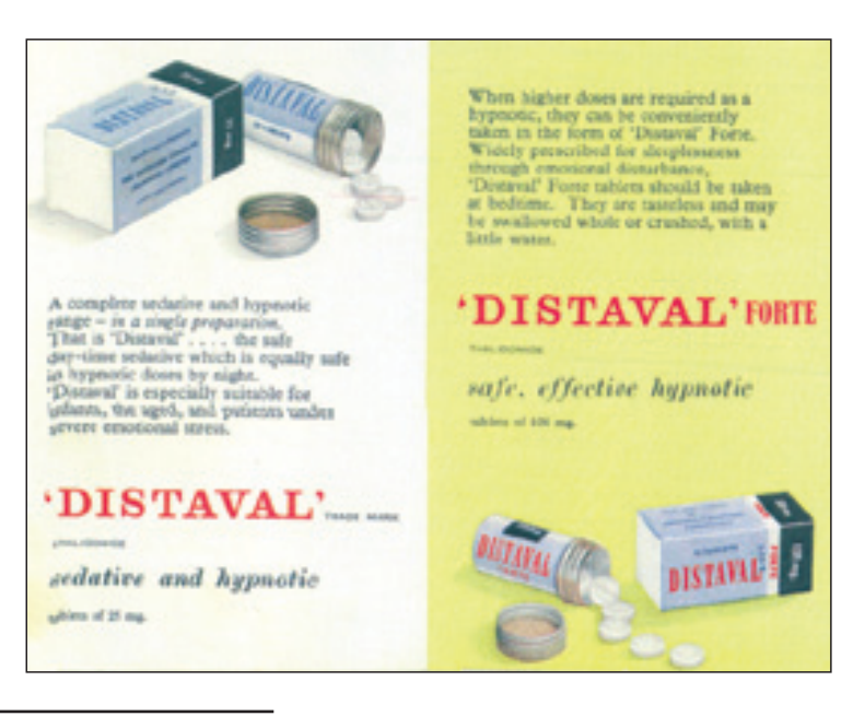
Figure 5 - Advertisement for Distaval (thalidomide) (1958).

made in transplantation over the last decades. Subsequent research showed that cyclosporin specifically targets the CD4+ lymphocyte (75) which has a pivotal role in the immunopathological mechanism of RA for which it was proposed as basic therapy (76) and for those of other rheumatological autoimmune diseases, such as Behçet's syndrome (77) and other non-autoimmune diseases, such as psoriasis (78).