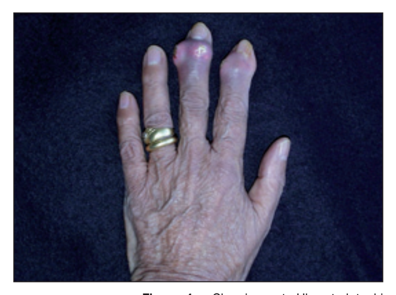
Figure 4 - Chronic gout. Ulcerated tophi localized at the interphalangeal joints in a woman with coexistent Heberden's nodes.

sa (Figure 2), and over the interphalangeal joints (Figure 3). Their development is usually related with both the degree and the duration of hyperuricemia. Long duration of active untreated disease, frequent attacks, upper extremity involvement, and polyarticular diseases are also associated with more aggressive tophaceous gout. Tophi tipically progress insidiously but the rate of their formation can be much faster in patients treated with diuretics or with severe