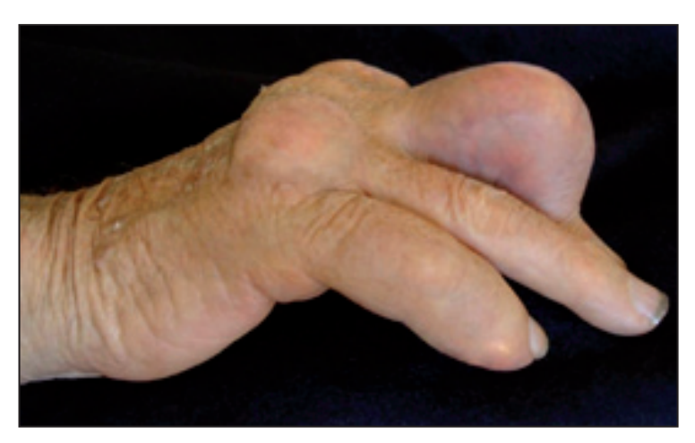
Figure 3 - Chronic gout. Extensive tophaceous deposits with relevant functional impairment but no spontaneous pain.

sa (Figure 2), and over the interphalangeal joints (Figure 3). Their development is usually related with both the degree and the duration of hyperuricemia. Long duration of active untreated disease, frequent attacks, upper extremity involvement, and polyarticular diseases are also associated with more aggressive tophaceous gout. Tophi tipically progress insidiously but the rate of their formation can be much faster in patients treated with diuretics or with severe