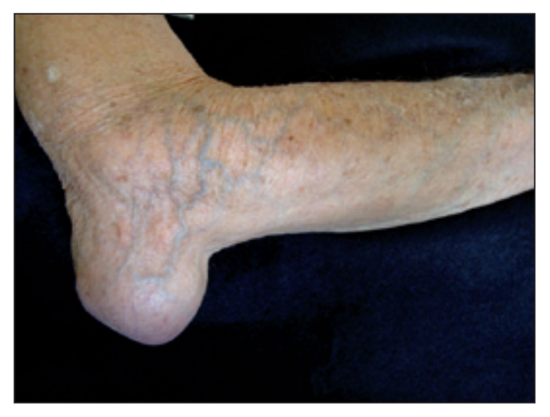
Figure 2 - Chronic gout. Giant tophus inside the olecranon bursa.

Chronic gout is the natural evolution of untreated hyperuricemia in patients with gouty attacks followed by pain-free intercritical periods. It is characterized by the deposition of solid MSU crystal aggregates in a variety of locations including joints, bursae and tendons. Tophi are deposits of MSU crystal aggregates in different tissues. They can occur in a variety of locations including the helix of the ear, olecranon bur-