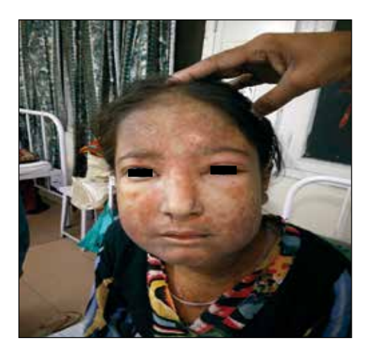
Figure 1 - Photograph of the patient at the time of presentation (with permission).

Hypoproteinemia was evident with total serum protein of 5.4 g/dL. Serum calcium, serum phosphate and fasting blood sugar level were normal. Urine complete examination revealed proteinuria. The 24 hour urine analysis showed a proteinuria of 3.2 g/day. Kidney biopsy showed grade IV lupus nephritis (Figure 2).