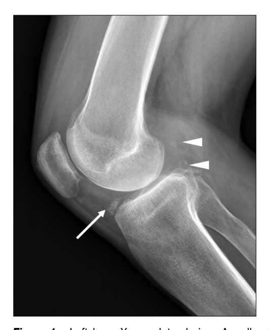
Figure 1 - Left knee X-rays, lateral view. A well-defined mineralized nodule is observed anterior to the tibial plateau (arrow). Other small bodies are present in the popliteal space (arrowheads). There are no signs of bone erosions.